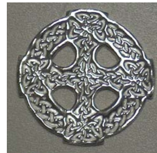
Finished Art Clay Silver piece created with Photopolymer Sheet at left.