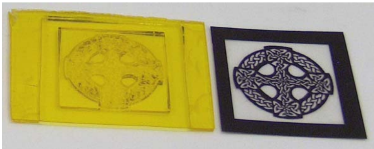
Transparency and finished Photopolymer Sheet image